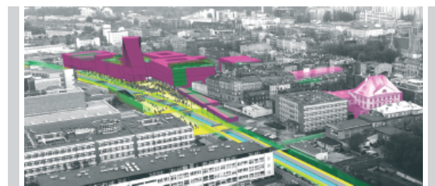
Figure 8. Visualization from a bird's eye view

The existing pedestrian routes should be preserved, but, nevertheless, their connections to public bus stops improved. To facilitate car traffic in the area, it is necessary to build two multilevel parking lots, located among the existing buildings, whereas, the present parking lot along the Rawa river should be demolished to improve the functionality of its boulevards [15].