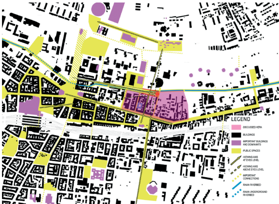
Figure 5. Location of the Student Centre in the context of the structure of Katowice and its connections with the surroundings