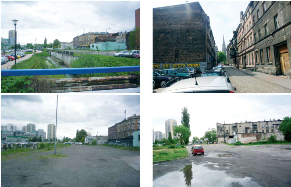
Figure 1, 2, 3, 4. Photographs taken in the discussed area